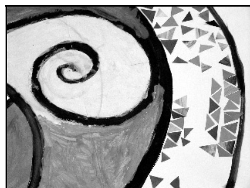
Detail from the Trinity painting: Cranhill Parish Church